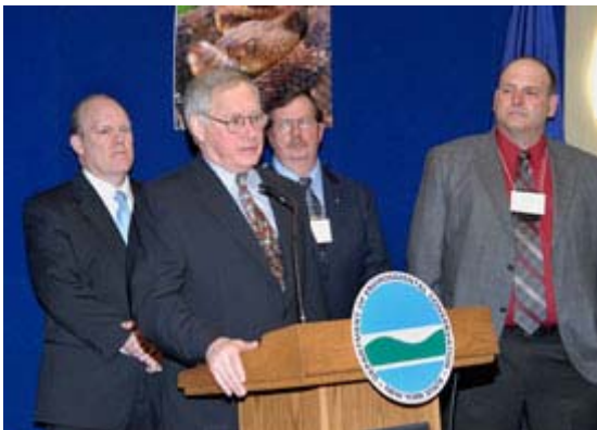
Commissioner Grannis describes the collaborative investigation

An extensive undercover investigation by the New York State Department of Environmental Conservation into the poaching, smuggling and illegal sale of protected reptiles and amphibians has led to charges against 18 individuals for 14 felonies, 11 misdemeanors and dozens of violations, DEC Commissioner Pete Grannis announced today.